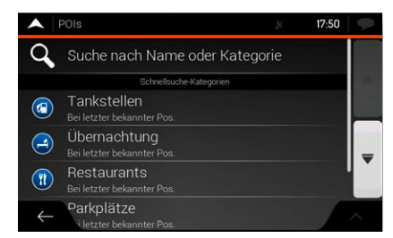
More than 6.5 million POI