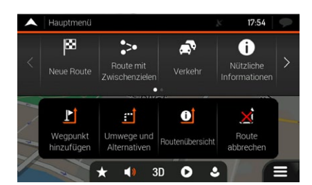
Fast and simple route calculation