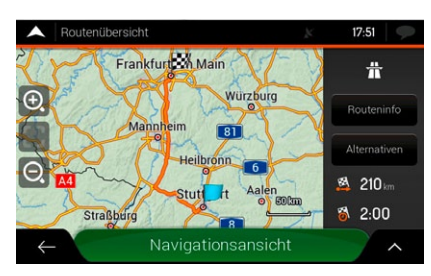
Clear map display