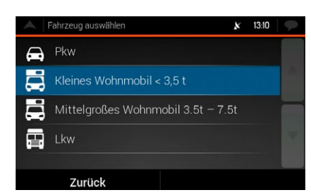
Configurable vehicle profiles