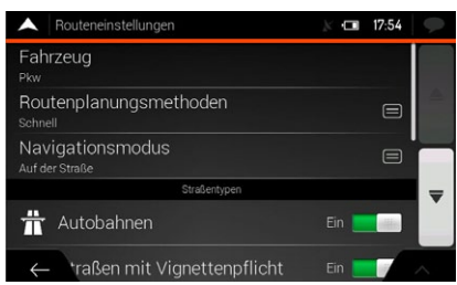
Various route planing options