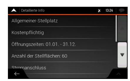
Camping POI package