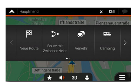
Motorhome route planning