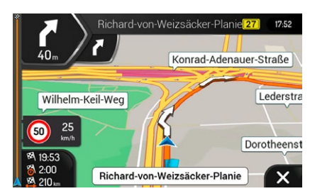
Unequivocal route guidance